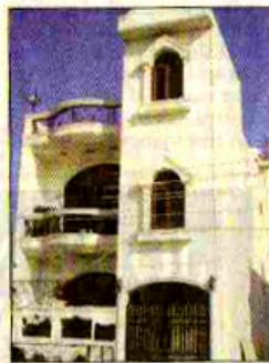
■ Many such houses in New Palam Vihar and other areas that fall within the alignment of a new expressway connecting Dwarka and Gurgaon are in line for demolition.